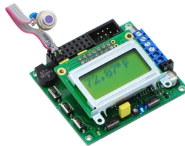
MLX90614 connection to SMBus. MLX90614 temperature sensor connected to an Orangutan SV-168.